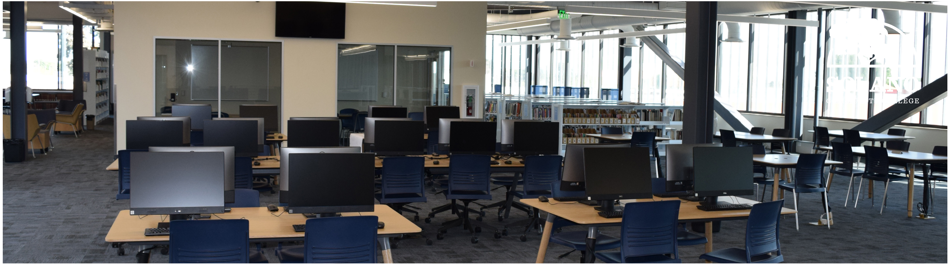
First Floor Layout